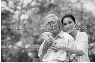
Copyright © 2018, Elsevier Inc. All rights reserved.