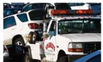
Below, the suspects' car is being towed as evidence and a helicopter from Channel 2 shared air space with 'copters from Channels 4 and 7, a CHP 'copter and a CHP fixed wing aircraft during the on-campus search for robbery suspects.