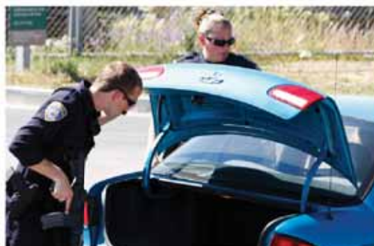
Officers inspected all vehicles leaving campus during the crisis, checking trunks and back seats for a possible weapon or backpack believed to be used during the commission of an armed robbery.